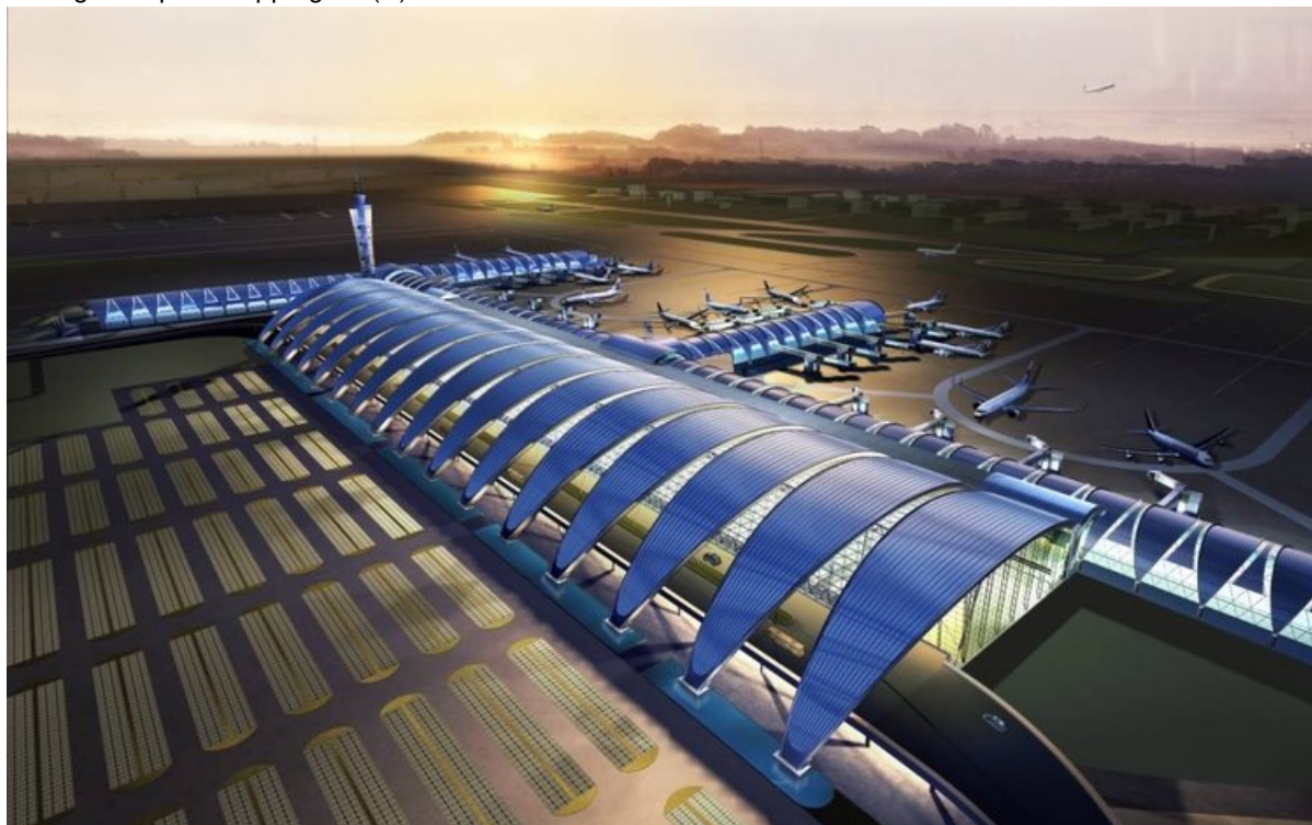
Chengdu airport dropping off, end the trip.